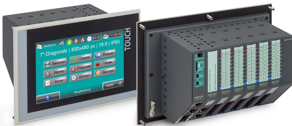
(Figure contains optional periphery modules)