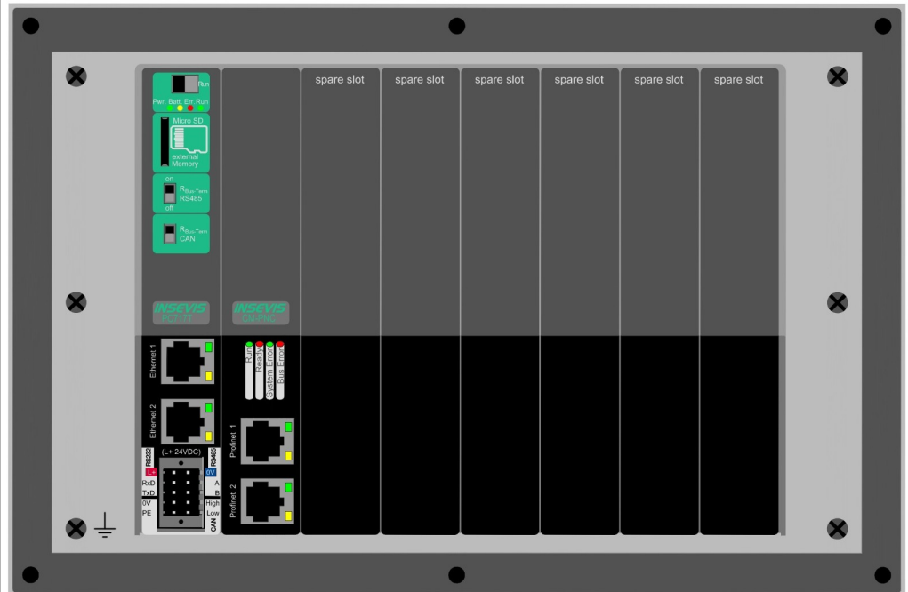
Figure above: View to rear side and connections sides of PC717T-PNC